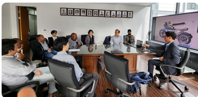
Meeting with Tanzanian students and other partners from Seoul National University

The connections formed during this visit are expected to strengthen E3's reach and enrich its future projects.