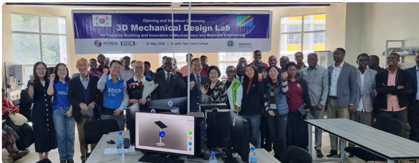
Inside the lab: State-of-the-art equipment including 3D printers, CNC machines, and high-performance PCs ready for student innovation

In another exciting development, our long-time partner ITEC held the official opening ceremony for their new 3D Print Mechanical Design Lab. Sponsored by KOICA, the lab is outfitted with high-spec computers, 3D printers, CNC machines, and more—providing students with access to cutting-edge tools for innovation.