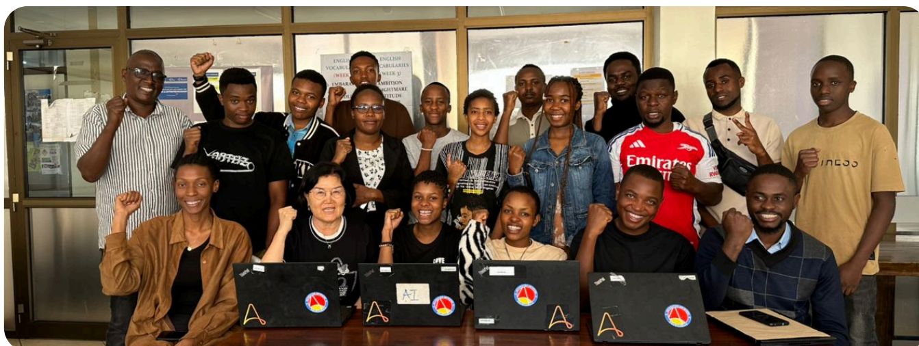
E3Empower Africa staff and interns gathered for a group photo at the Arusha office, celebrating teamwork, mentorship, and shared vision.

Their continued commitment is a strong indicator of the lasting influence of our internship experience, and we are grateful for their dedication to mentoring the next generation.