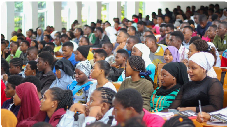
Students at TICD Tengeru attentively follow a JA SEP session on entrepreneurship and social impact.

E3Empower Africa has accomplished 50% of the 2025 contract requirements in less than three months, a testament to the effectiveness of the program and the dedication of our facilitators and student participants.