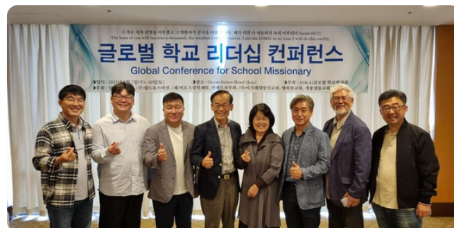
Joining fellow leaders and educators at the Global Conference for School Missionary - Korea

Her visit was also filled with meaningful meetings and relationship-building. She met with several partners, including Wales International School, Way Maker Alternative School, high school prayer teams, partner churches, and many individuals