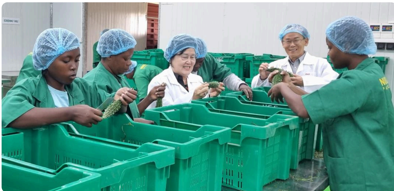
Team members join local women in the packing process during the grand opening of NuruSafe, marking the beginning of operations and community-driven agricultural impact. - Arusha