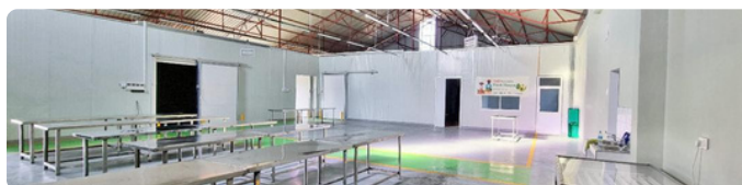
Highlights from the launch of NuruSafe's operations: the fully equipped cold room, freshly harvested Karela, the active sorting room, and scenes from the grand opening event