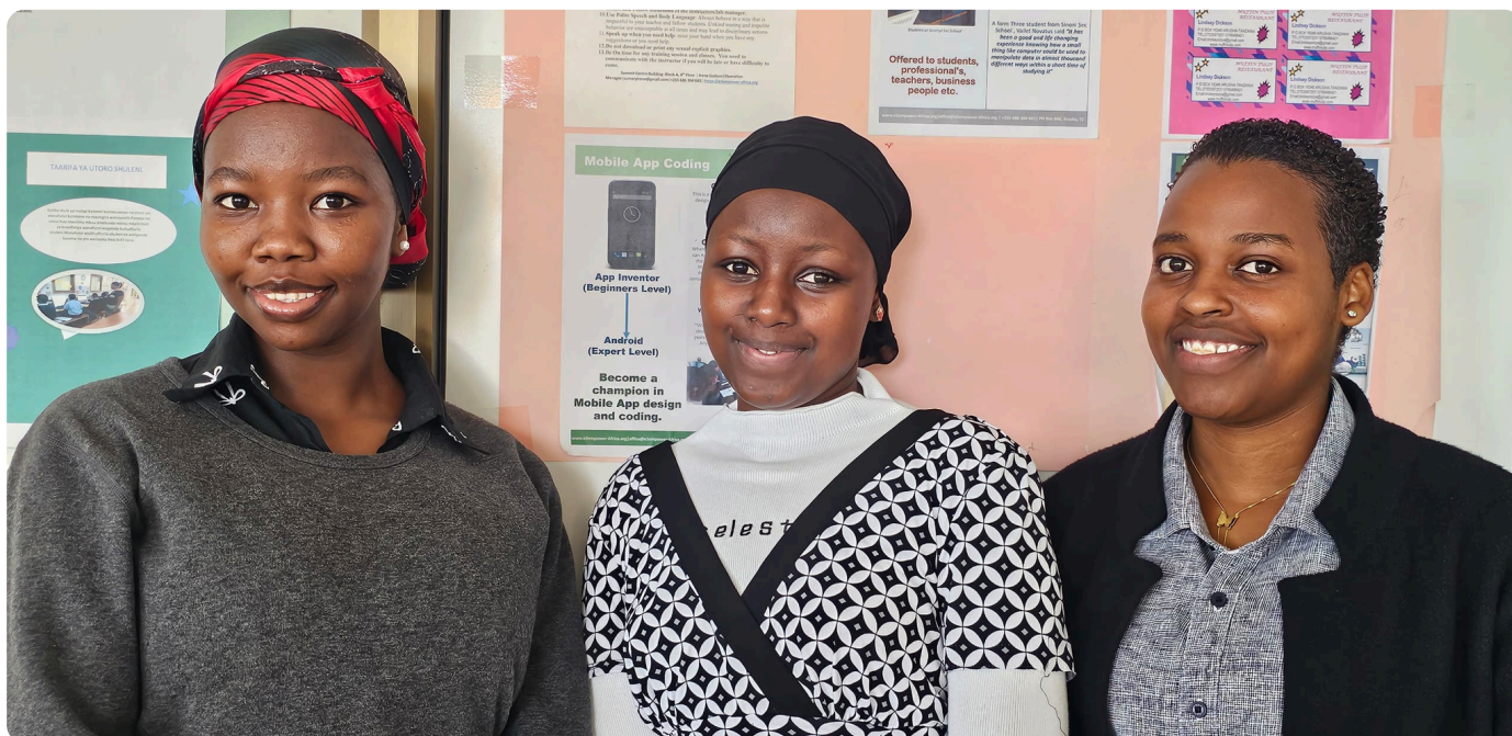
Back where it began: Alumni interns return after two years to mentor and guide the next generation.