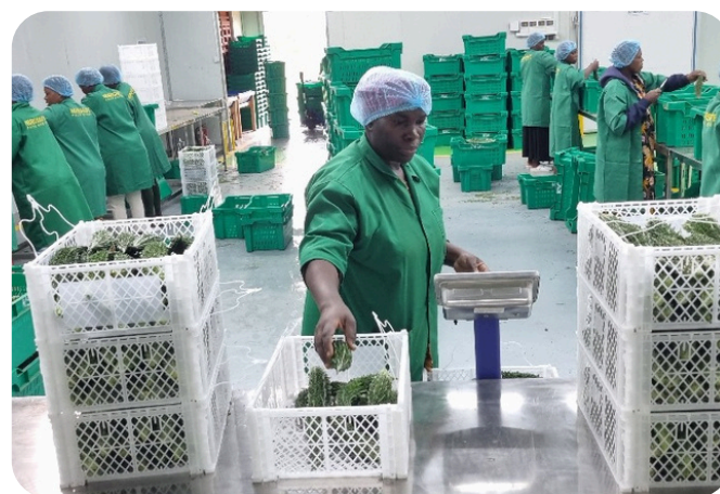
Women at work: Staff sort and pack Karela for weekly shipment to the UK, creating jobs and boosting local agribusiness.- Arusha